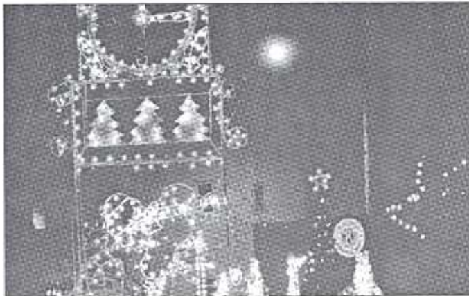
A $1,500 grant purchased lights and will help maintain the holiday atmosphere at O'Neil Park.