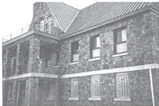
FIELD HOUSE - Built in 1939. WPA Project. With the help of a $6,500 grant from the CCF, much needed repairs were made to the exterior of the Field House - take a look!

Many Board Members and volunteers helped to